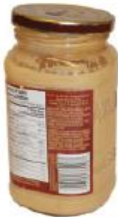
Crooked lid, vacuum button raised, other evidence that cap has been opened