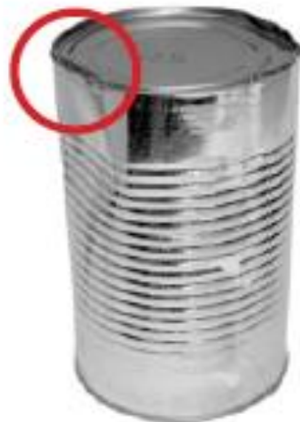
Dented at junction of side and end