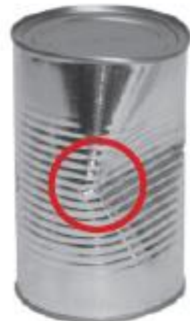
Sharp dent or dent on seam