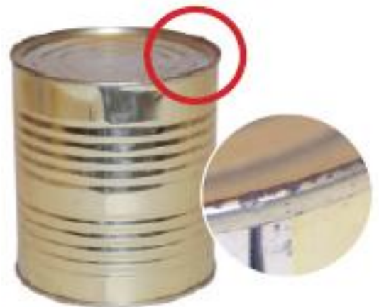
Pitted rust or leaking

Cans with any of these defects may be unsafe. Discard them!