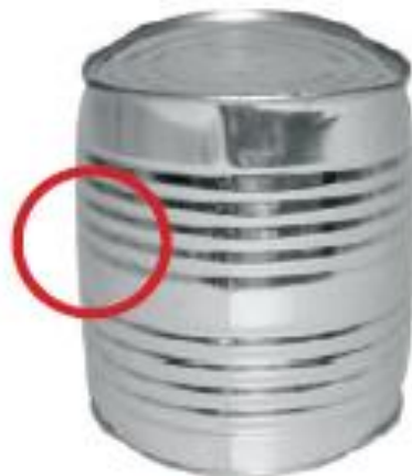
Swollen or bulging