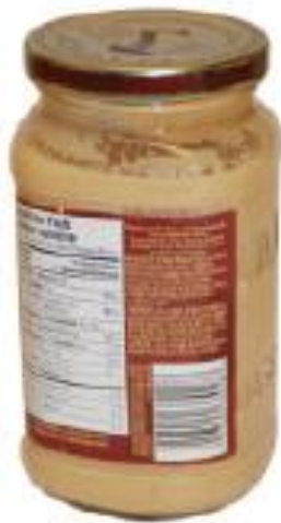
Inner seal or tamper resistant tape missing or broken