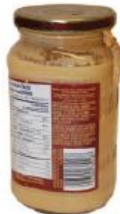
Leaking, crack or chips, or product discoloured

Jars with any of these defects may be unsafe. Discard them!