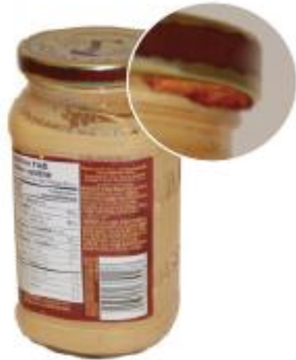
Dirt under the rim